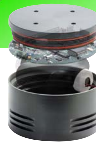
Groundhog G-10 Sensor